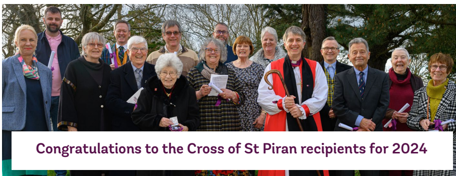
Congratulations to the Cross of St Piran recipients for 2024