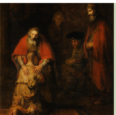
Friday 8th March 10am - 4pm