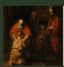
Friday 8th March 10am - 4pm