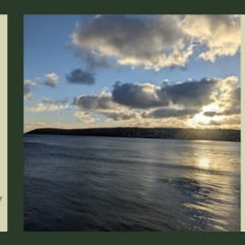
Friday 12th July