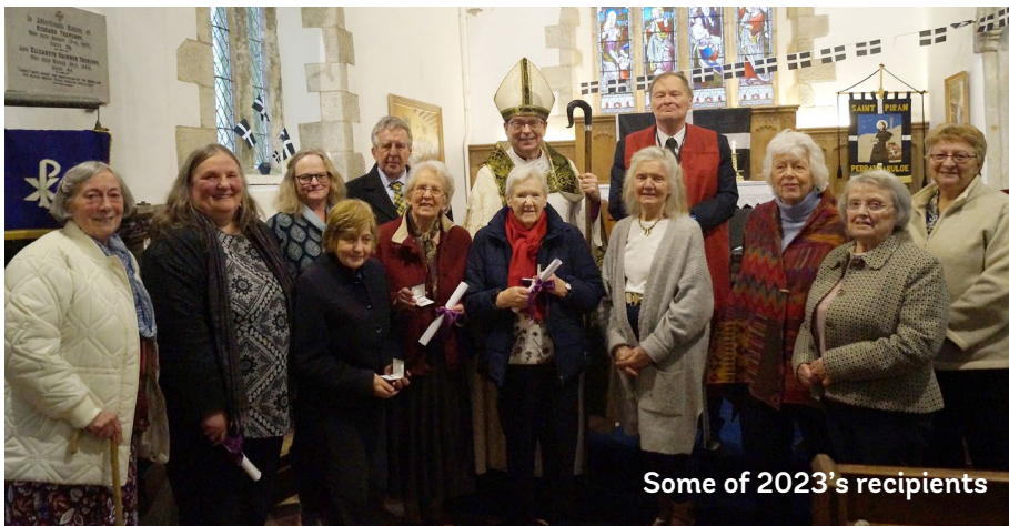
Some of 2023's recipients