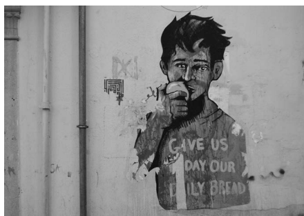
Street art in Lebanon

"Lebanon is also a multi-faith society. Of course it has had its own traumatic conflicts, but it is perhaps the one place in the Middle East where there is a genuine commitment to religious plurality. So another reason why I'm going is to speak to leaders of various faith traditions about the work I've done in the whole realm of Freedom of