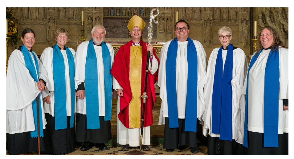
THE CLASS OF 2021: New Readers with Bishop Hugh after last year's service