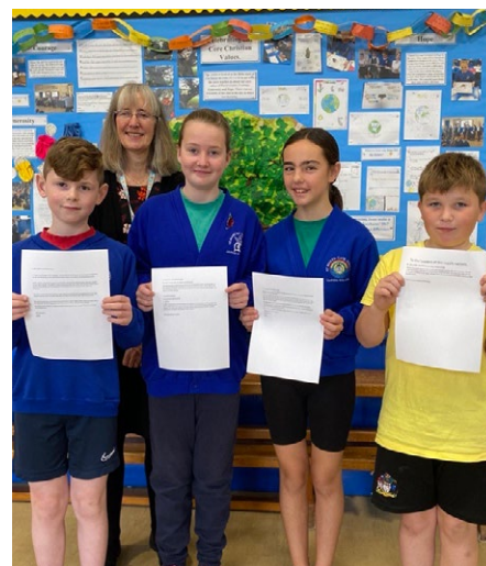
ABOVE: Pupils from St Mary's School in Penzance with their letters