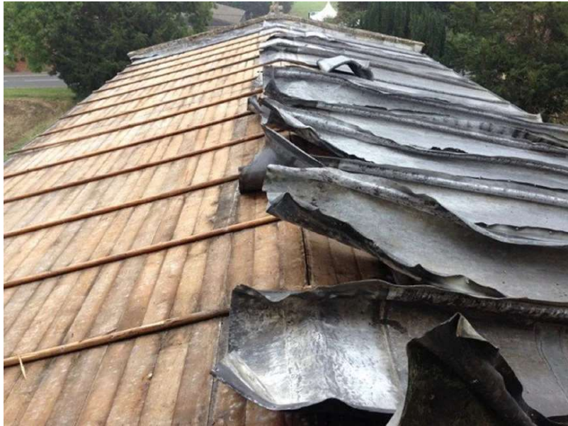
Metal stripped from the roof of a church