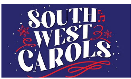
and stories, fun and engaging audience interaction points, and more.

Featuring traditional carols, creative musical items, a nativity produced by children across the region, items to make you laugh out loud, interviews