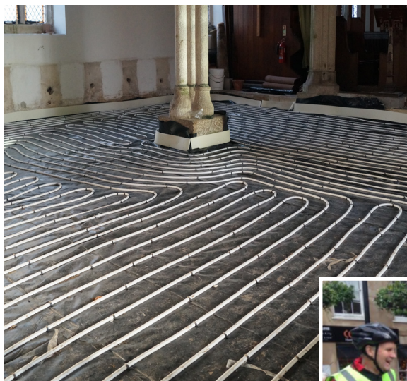
LEFT: Under floor heating going in at St Wenn Church in 2016