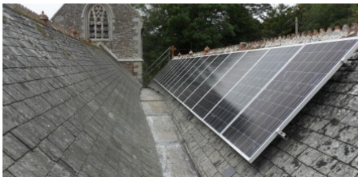
RIGHT: Solar panels on Mevagissey Church

Now go through the list and pick out a further two or three that you feel might be feasible to implement in your church. Discuss, exploring particularly why some churches may find it easier to do some things than others. What lies behind these differences do you think? Which single item in the list might be the one that you would recommend next to your PCC or church council? Why?