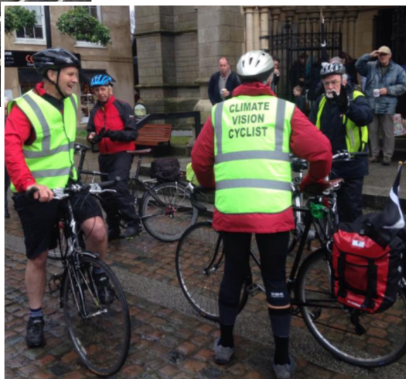
RIGHT: Cyclists leave from Truro Cathedral in November 2015 to take the message of support for Climate Control to the international summit in Paris.