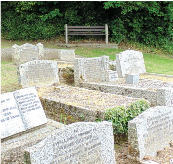
↑ A bench at Kenwyn Church graveyard is a welcome space to rest and reflect