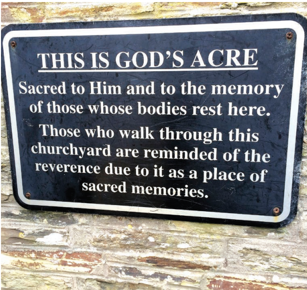
↑ A 'Gods Acre' sign sets the tone of a visit to the graveyard in Padstow