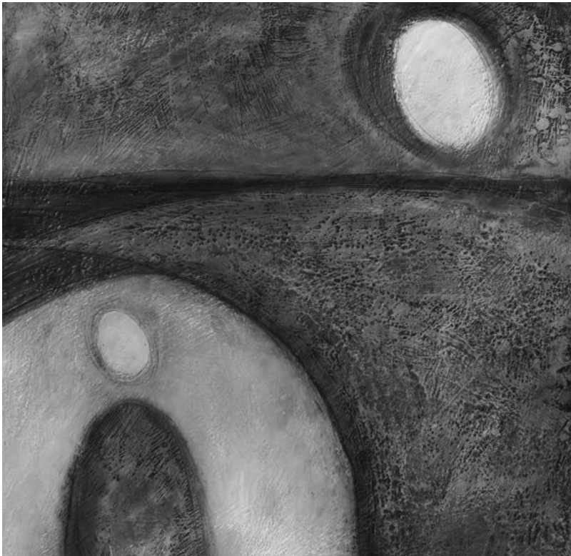
Something Understood by Bridget Braybrooks ©